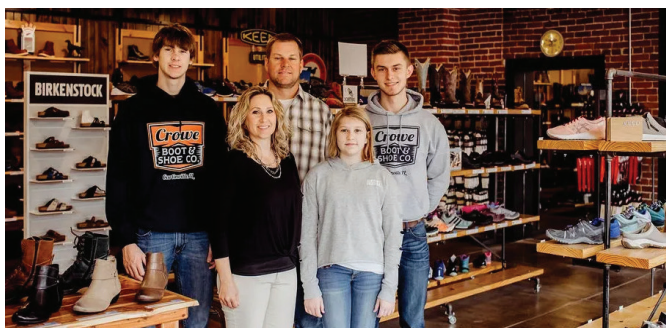
Crowe Boot & Shoe - August's Featured Business