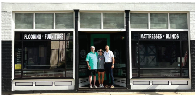
Heinz Furniture - October's Featured Business

Our past three "Meet the Member" featured Carlinville businesses: