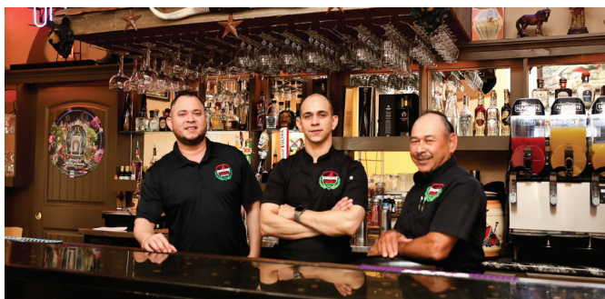
Potrillo's Mexican Grill - September's Featured Business