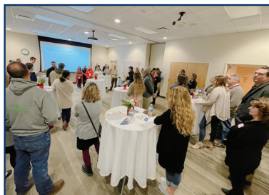
Carlinville Area Hospital: January's After Hours host.